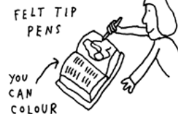
FELT TIP PENS YOU CAN COLOUR THE BOOKS THAT ARE LEFT IN THE PEWS