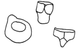
POTTY / NAPPIES / PANTS