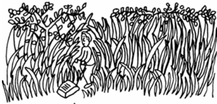
THE GARDENER'S JOB IS TO MAKE IT NAVIGABLE

FOR ENVIRONMENTAL REASONS CHURCHES ARE ENCOURAGED TO LET THEIR CHURCHYARDS GO BACK TO NATURE