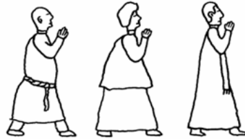
WHY THOSE PEOPLE ARE DRESSED STRANGELY

September is a busy month – plenty of children starting school and many families starting new daily routines. The Church too will be doing new things – in October, we will be starting a course in Christian Basics. The Course is a 6/7 week course in the basics of the Christian Faith suitable for enquirers, those new to faith, and those who want to learn more about Christianity. There will be an opportunity for Confirmation on 29 November 2009 at 1030am for those who want to take that step.