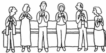
WHY THOSE PEOPLE ARE LOOKING AT US IN A FUNNY WAY