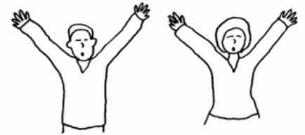
WHY THOSE PEOPLE ARE ACTING ODDLY