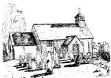
St Winfrith's, East Dean