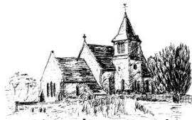
St Peter's, East Tytherley