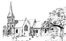
St John's, Lockerley