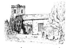
St Peter's, West Tytherley